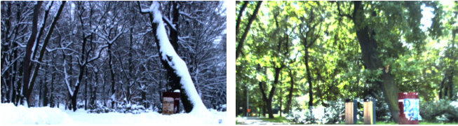
Fig. 2. Seasonal environment variations captured by the outdoor dataset.

To evaluate the usefulness of the approach, we apply it to the problem of visual-based localization in changing environments. Here, the environment representation is composed of several local maps that consist of collections of visual features visible at the particular locations. The visibility of the individual image features [16] over time is represented by FreMen, which allows to predict their visibility for a particular time and use the time-specific features for visual localization. The experiments were performed both indoors and outdoors. The indoor experiment was performed at Lincoln Centre for