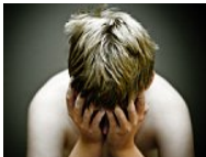
Shockingly common, the cruel