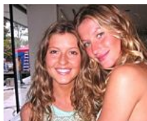
Celebrities You Didn't Know Had Twins (14 Ph... TopChartCelebrities.com