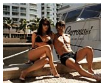
The Internet Loophole That Made One Man a M... Google Sniper