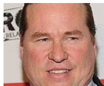
15 Celebs Who Gained A Lot of Weight ThrivingCeleb