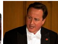
Commons in chaos over EU law vote: