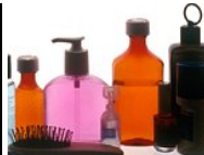
Why cough medicine is a waste