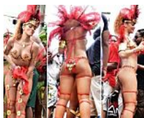
Top 11 Most Outrageous Rihanna Outfits! Celebrity Revolt