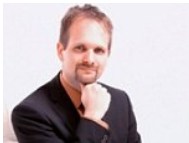
You Britons are just too lazy! After Mail