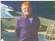
Pervert past of millionaire who