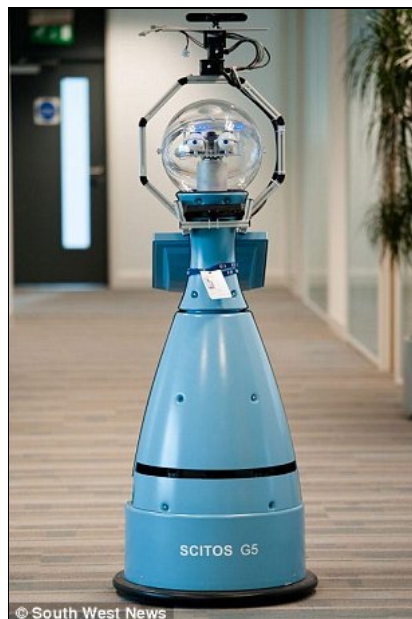
Bob the security robot moves around at the G4S Technology offices in Tewkesbury, Gloucestershire