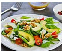
10 Foods to Eat to Burn More Calories Womanitely