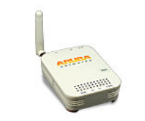
Aruba Networks Launches Indoor Wi-Fi ... Investors.com