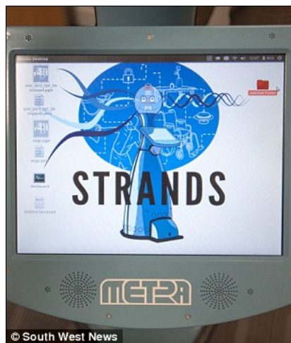
Security robot Bob's ID card at the G4S Technology offices in Tewkesbury is pictured on the left, while the right image shows the control screen used to control Bob's actions

It is hoped the pilot project will help Bob learn more about coping with other people - and machines - in the workplace.