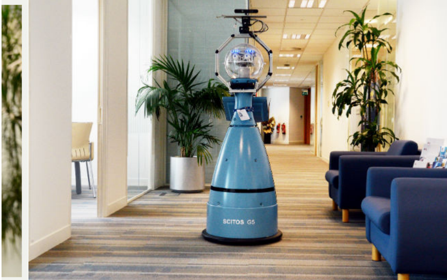
Bob the robot has been on trial as a security guard at Tewkesbury-based G4S Technology.