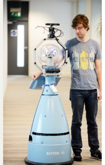
Bob the robot